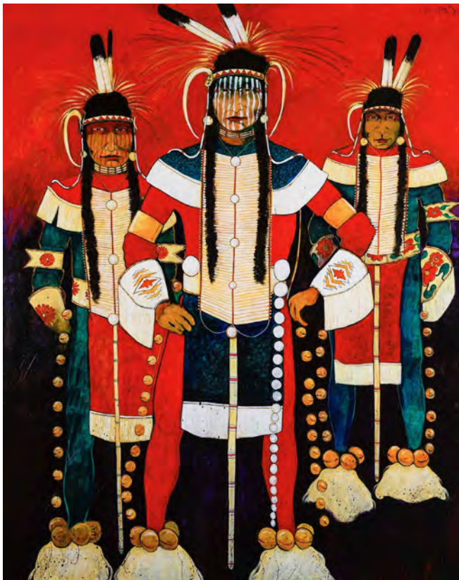
Three Crow Indian Hot Dancers Acrylic | 60" x 48" | $35,000