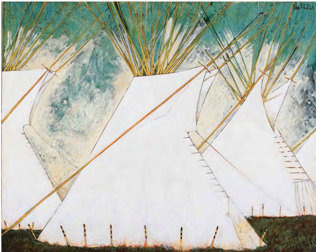
Crow Tipis On The Big Horn Acrylic | 24" x 30" | $10,000