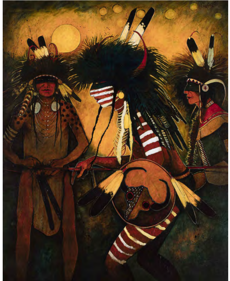
War Stories Told Acrylic | 60" x 48" | $35,000