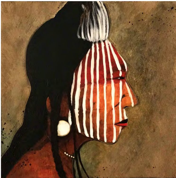
Big Dog Acrylic | 20" x 20" | $9,000