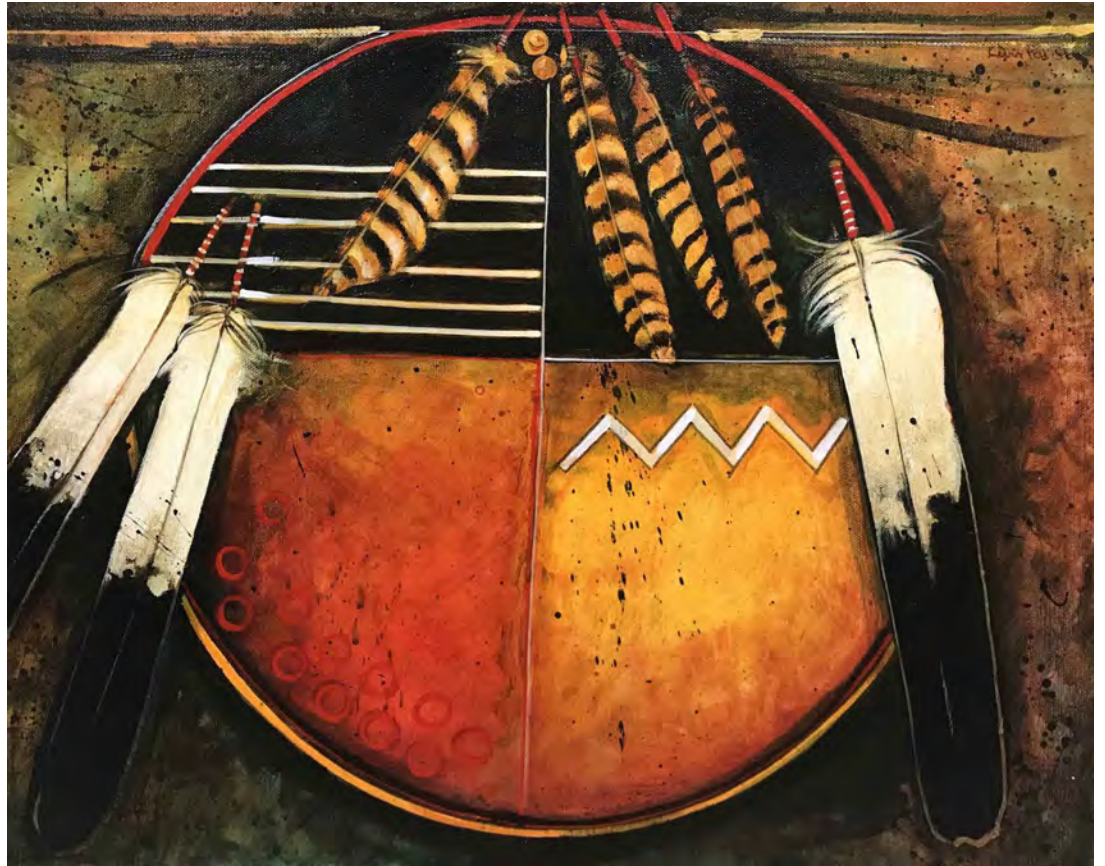
Beartooth Mountain Shield Acrylic | 16" x 20" | $8,500