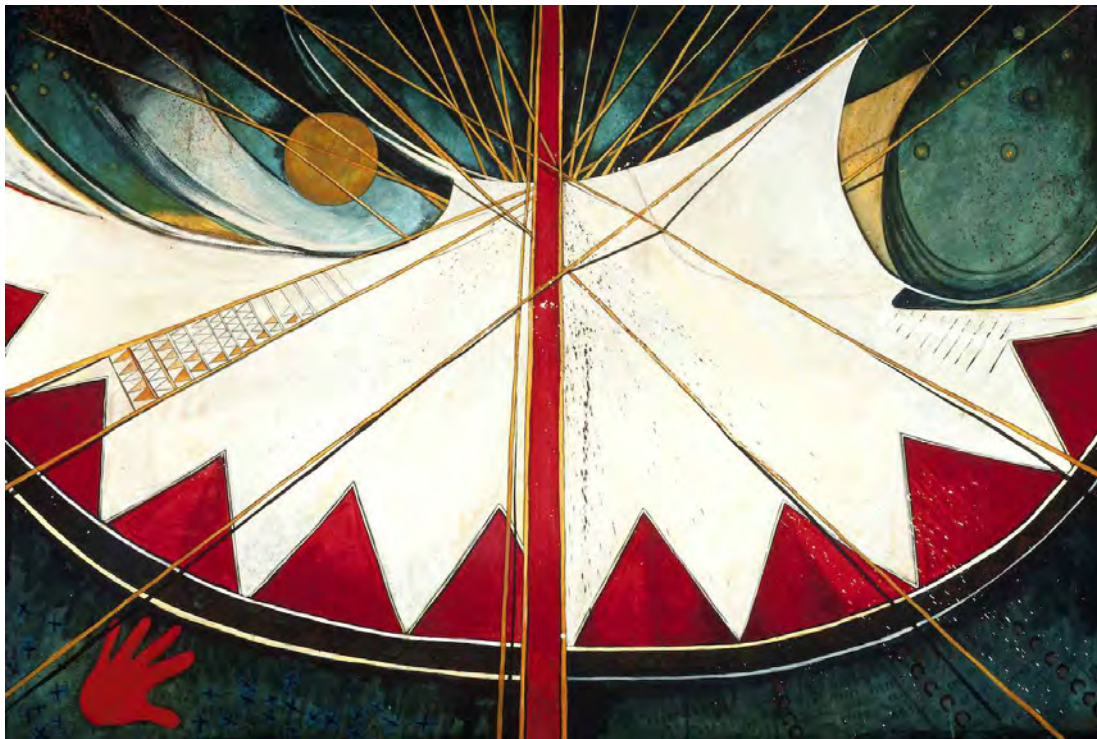
Pretty Shawl's Red Mountain Tipi Acrylic | 48" x 72" | $42,000