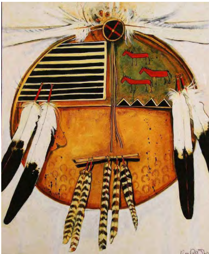
Eagle Feather Shield Acrylic | 24" x 20" | $9,000