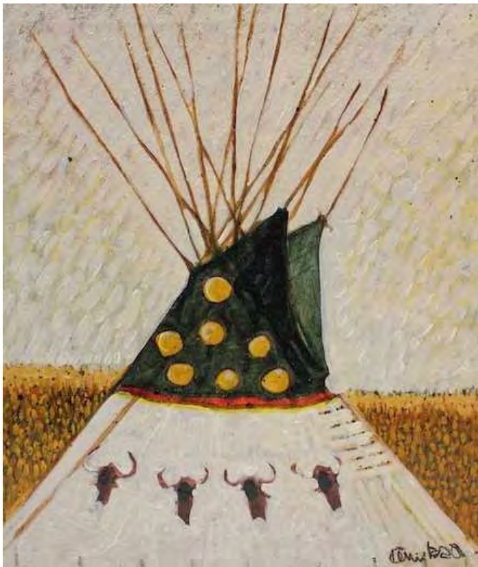
Buffalo Tipi Acrylic | 14" x 12" | $6,000