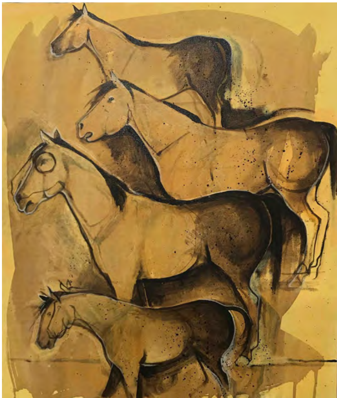
Mountain Crow Ponies Acrylic | 24" x 20" | $9,500