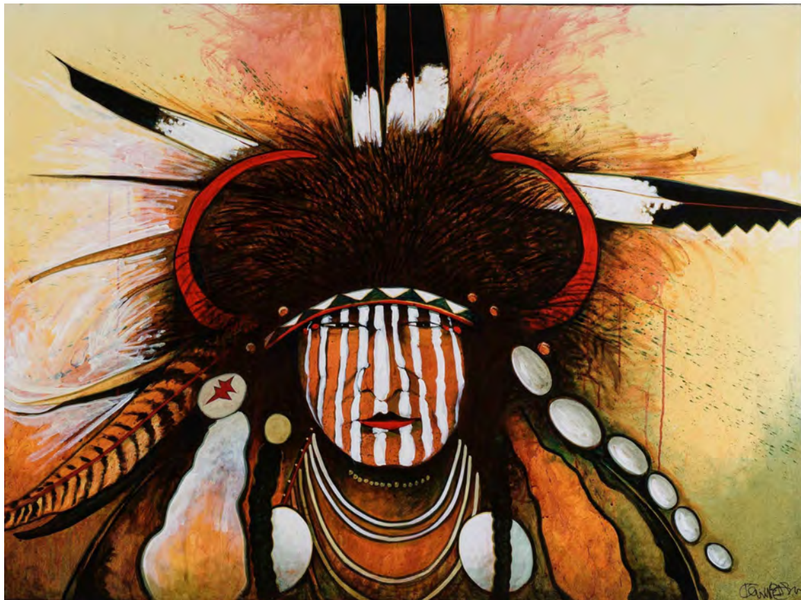
Spotted Weasel Acrylic | 36" x 48" | $18,000