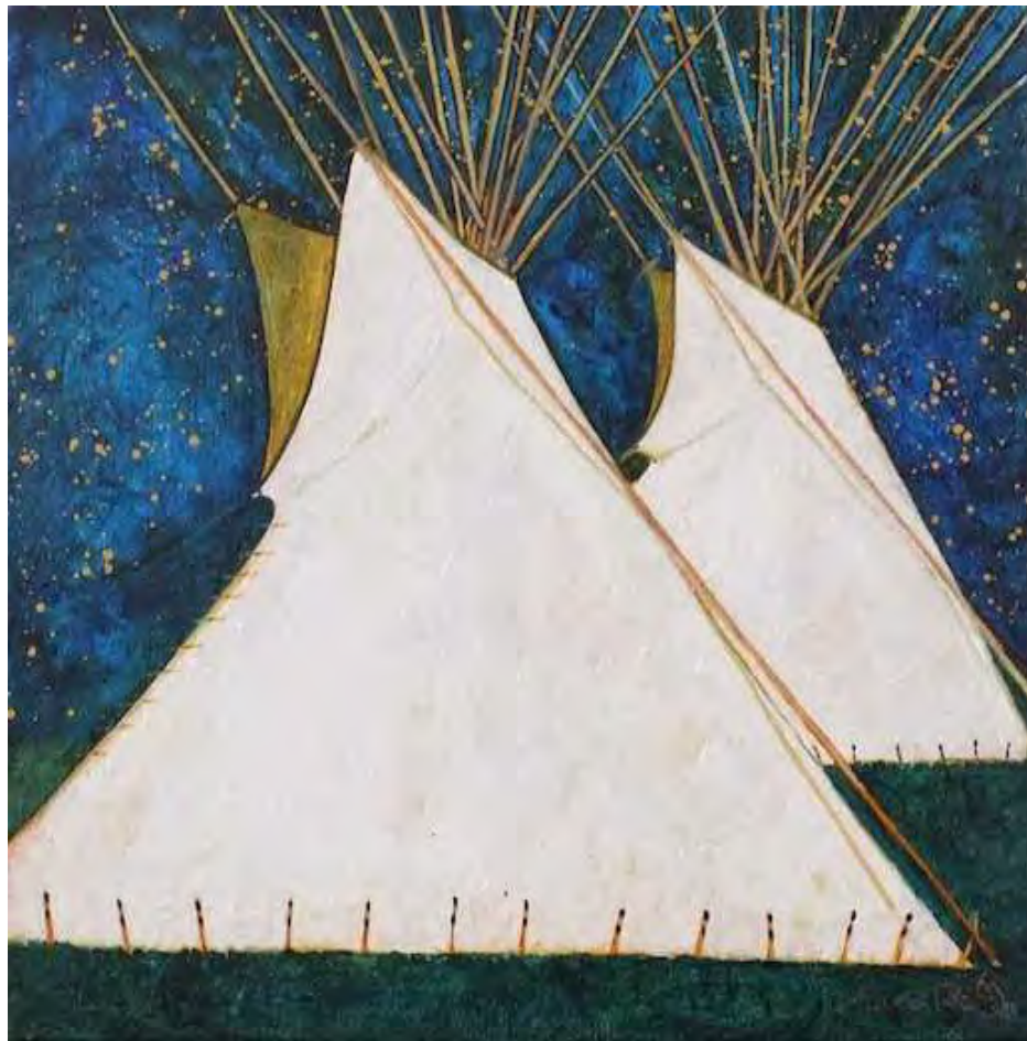
Crow Indian Tipis Acrylic | 12" x 12" | $4,500