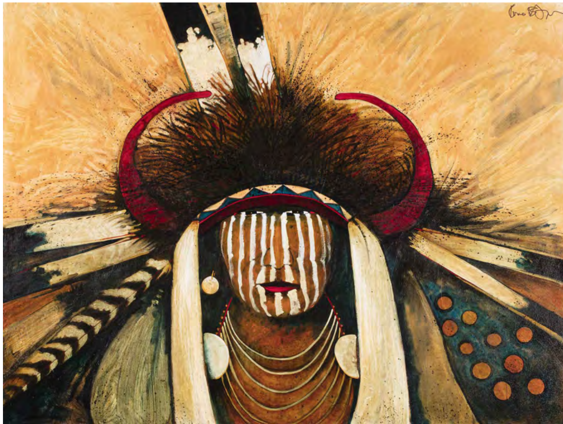
Medicine Man Healer Acrylic | 36" x 48" | $22,000