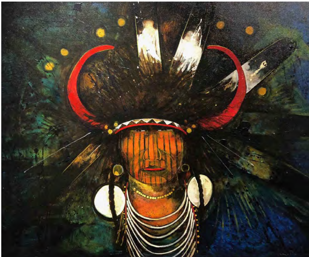
Yellow Hawk Acrylic | 24" x 30" | $14,000