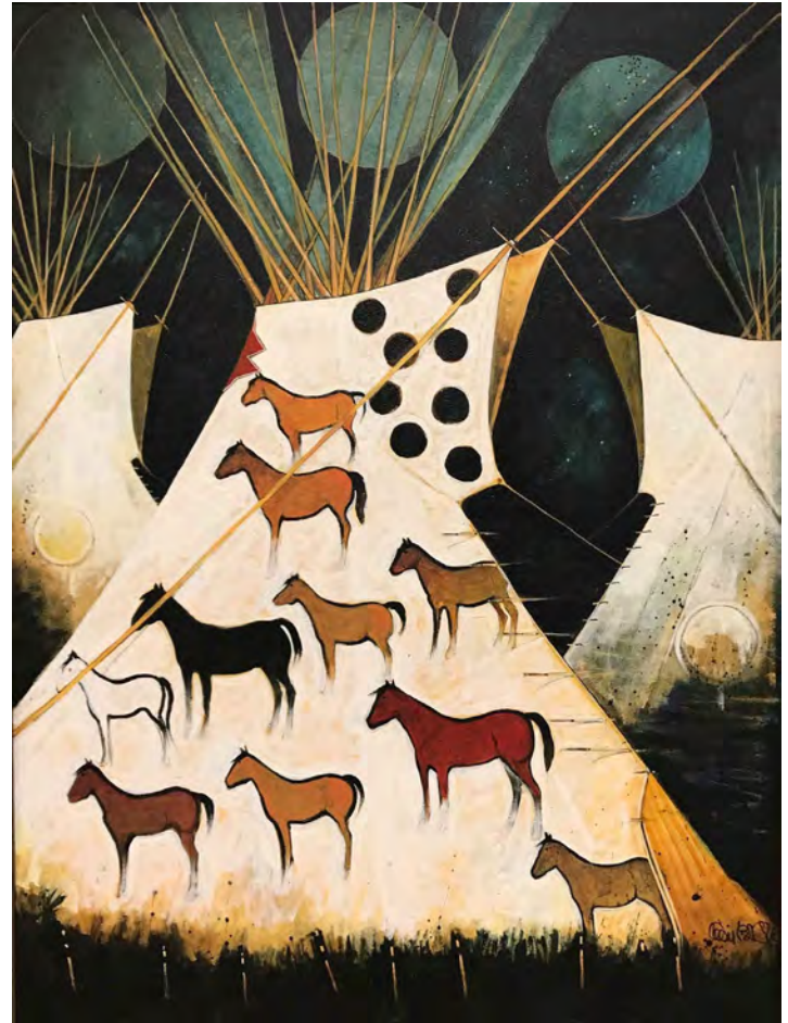
Horse Lodge Acrylic | 40" x 30" | $18,000