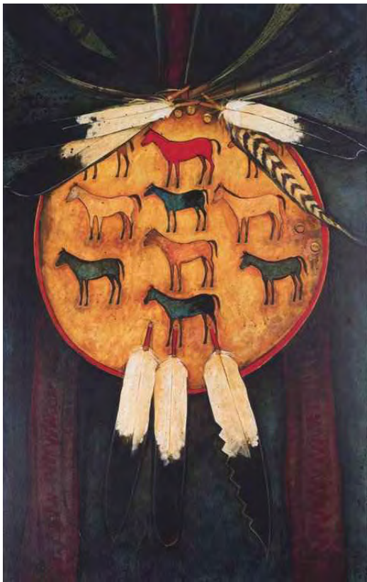
Horse Shield Acrylic | 40" x 30" | $19,500