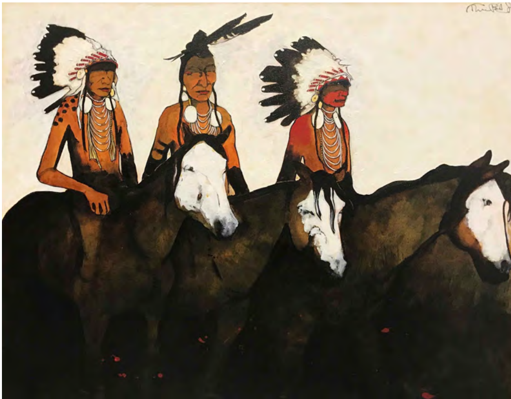
War Council - Crow Indians Acrylic | 24" x 30" | $12,500