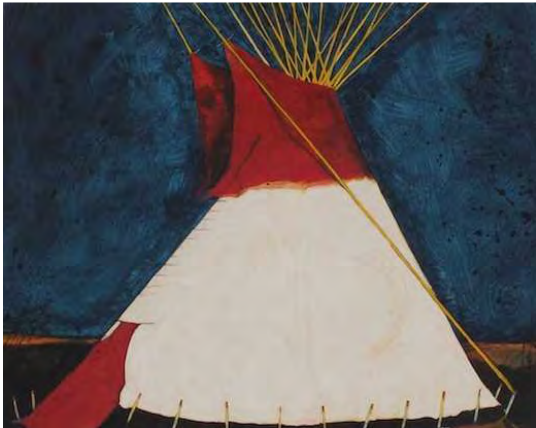
Night Lodge #3 Acrylic | 24" x 30" | $10,000