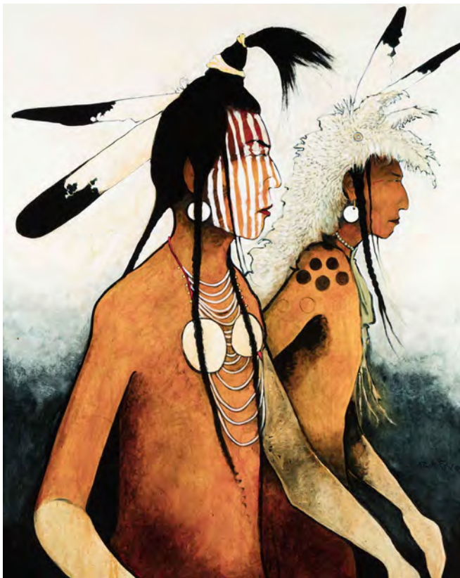
Crazy Indian Warriors Acrylic | 60" x 48" | $35,000