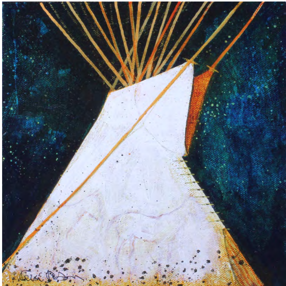
Crow Tipi Horse Tipi Acrylic | 8" x 8" | $2,500