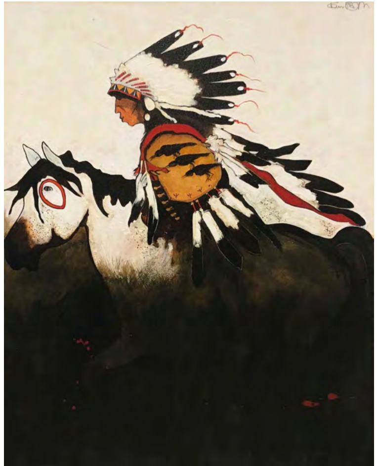
Three Raven - Crow Indian War Horse Acrylic | 30" x 24" | $12,500