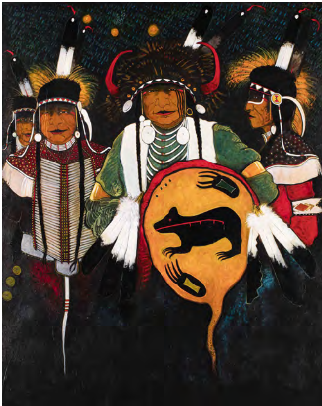
Bear Medicine Victory Dance Acrylic | 60" x 48" | $35,000