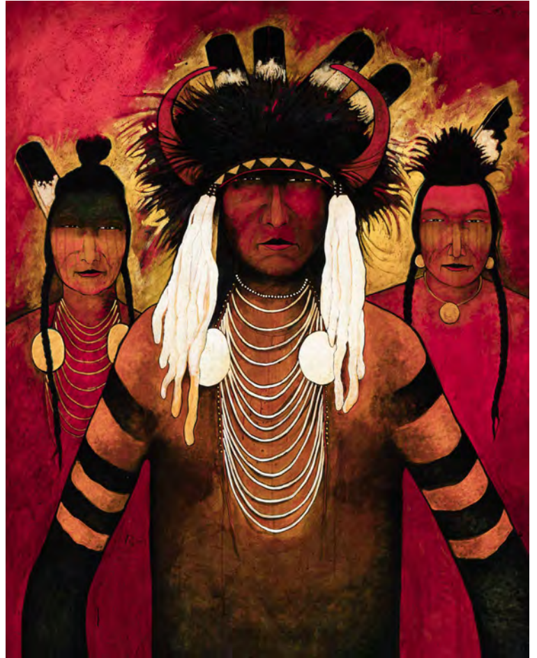
Crow Wolves Acrylic | 60" x 48" | $35,000