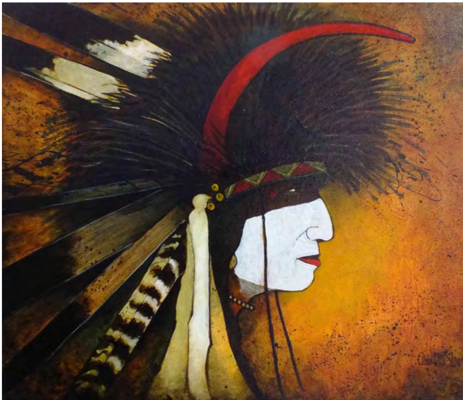
Crazy Dog Warrior - Crow Indian Man Acrylic | 20" x 24" | $9,000