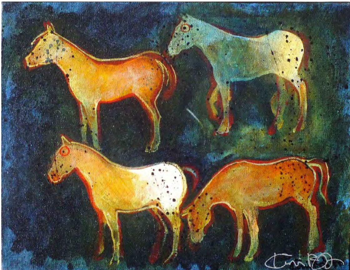
Crow Indian War Ponies Acrylic | 11" x 14" | $5,500